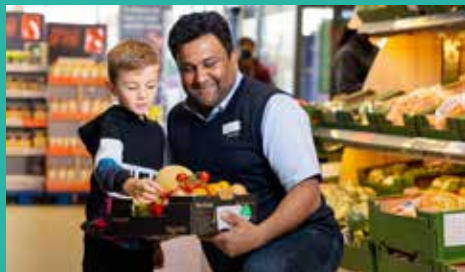
A similar Lidl store